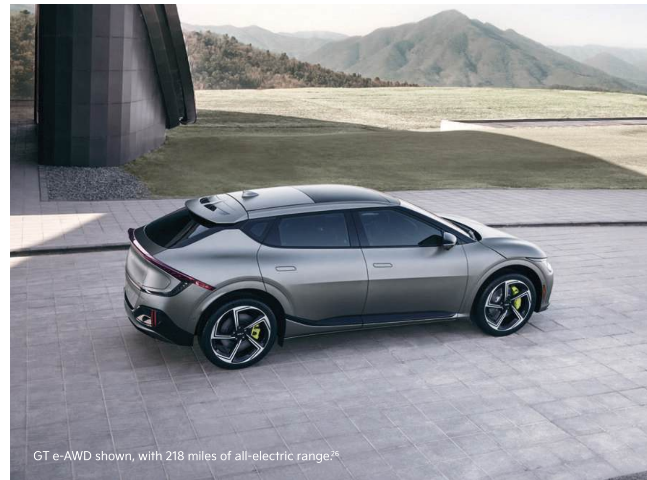
GT e-AWD shown, with 218 miles of all-electric range. 26

All-electric Range 26* (Light Long Range RWD, Wind RWD, GT-Line RWD w/19-in. Wheels)